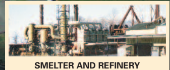
SMELTER AND REFINERY