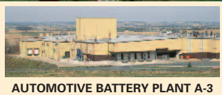
AUTOMOTIVE BATTERY PLANT A-3

QUALITY SYSTEM CERTIFIED ISO 9001 ISO/TS 16949 ENVIRONMENTAL SYSTEM CERTIFIED ISO 14001