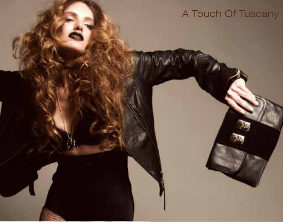
A Touch Of Tuscany