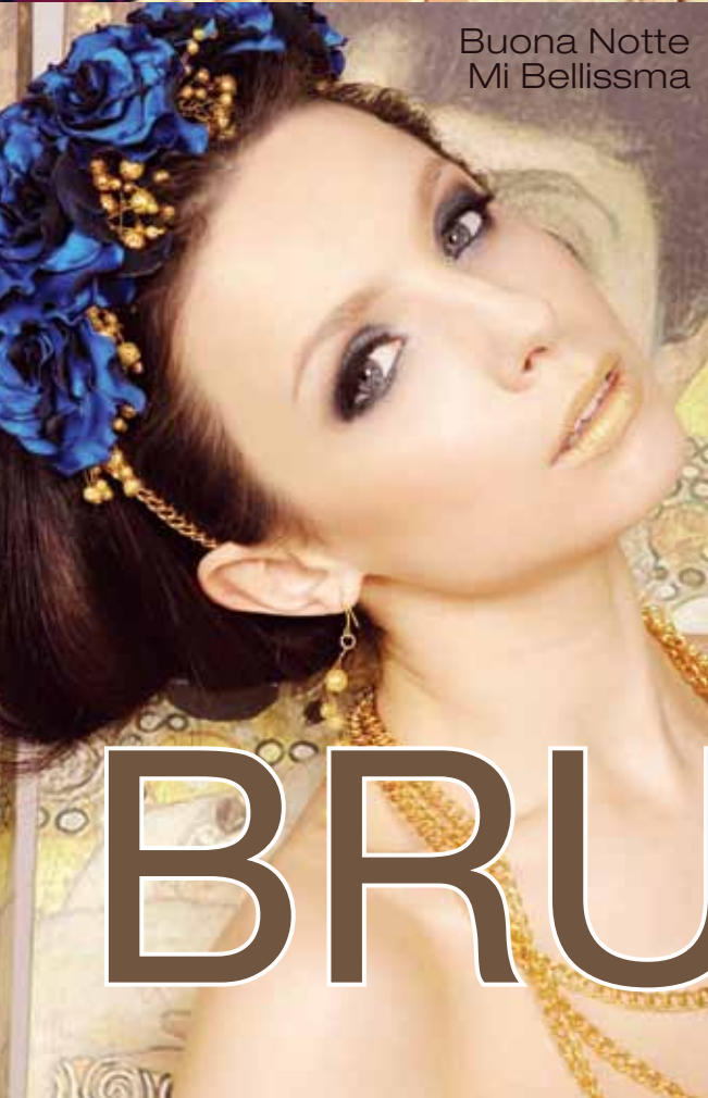
Buona Notte Mi Bellissima