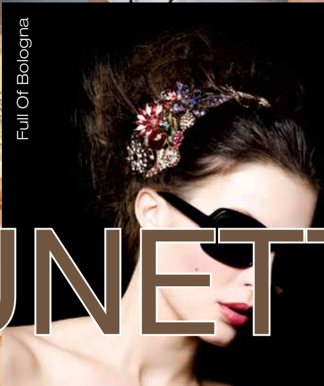
Full Of Bologna