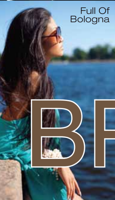
Full Of Bologna