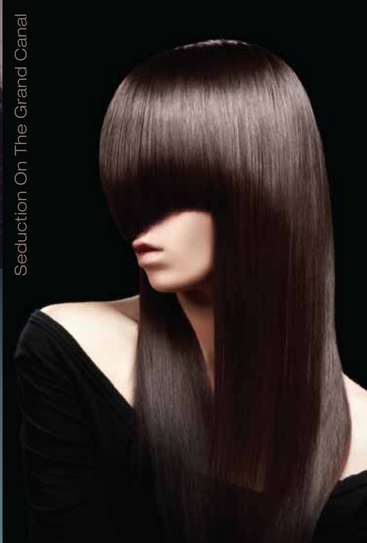
Seduction On The Grand Canal