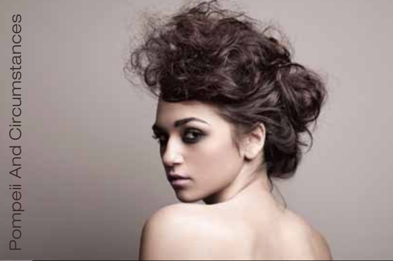
Pompeii And Circumstances