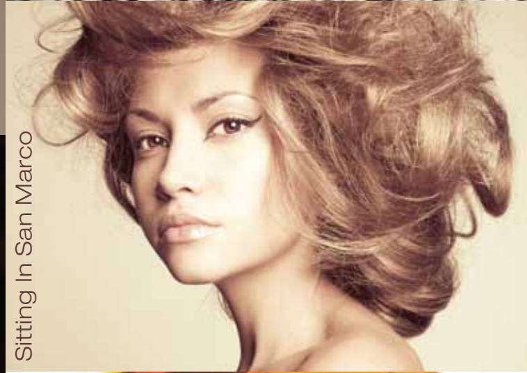
Sitting In San Marco