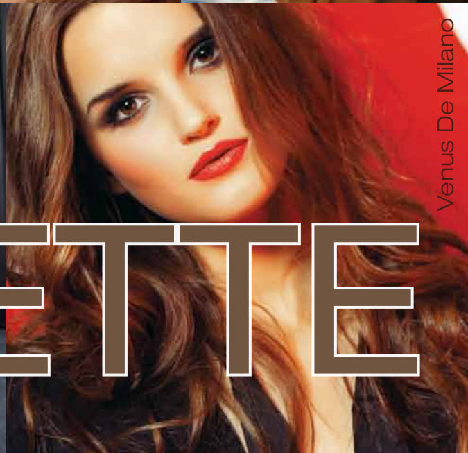
Venus De Milano