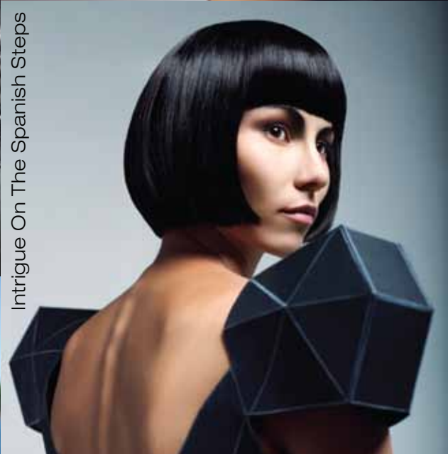
Intrigue On The Spanish Steps