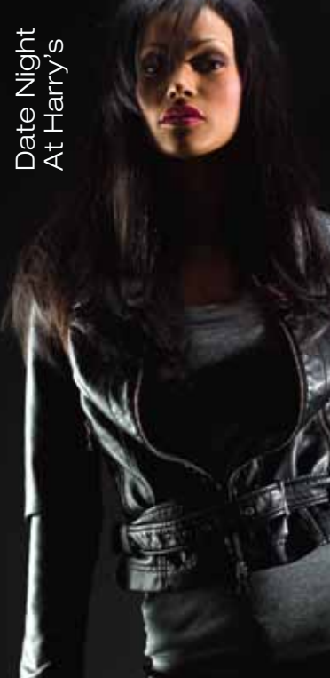
Date Night At Harry's