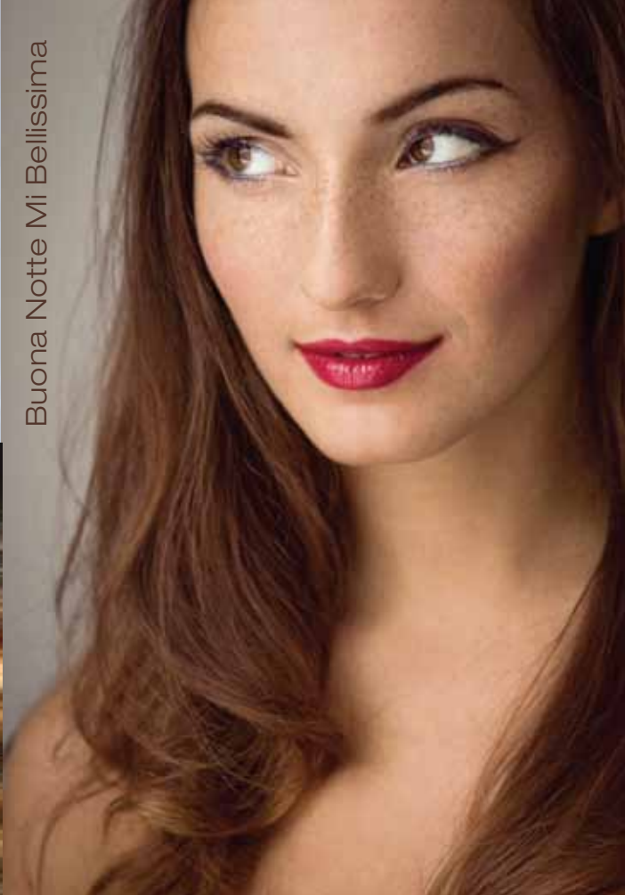
Buona Notte Mi Bellissima