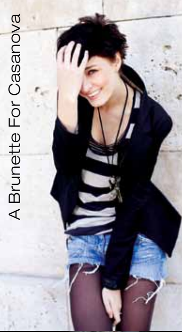
A Brunette For Casanova