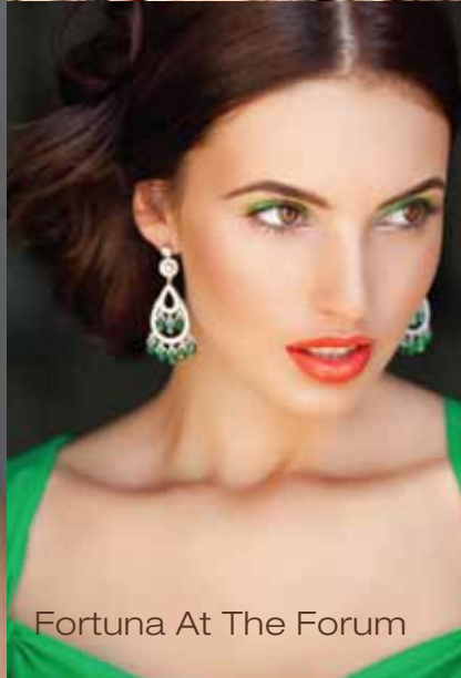
Fortuna At The Forum