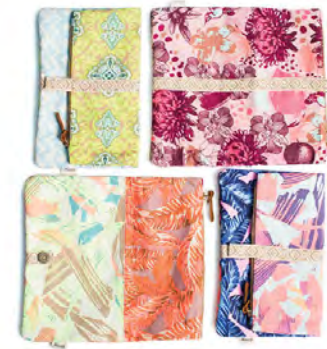
ASSORTED ENVELOPE POCKET* 1106MAX