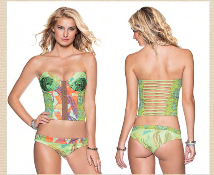
TOP Hearts & Crafts BOTTOM

1808MTN (Without molded cups)* 1808MBB (Signature cut) 1808MBD (Chi chi cut)* S M L XL S M L