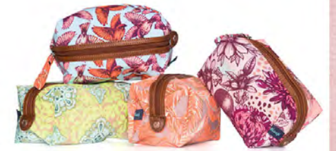
ASSORTED COSMETIC POUCH* 1105MAX