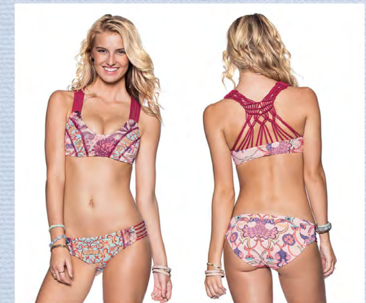
TOP Ma Jolie BOTTOM

1818MBB (Signature cut) 1818MBC (Cheeky cut)* S M L