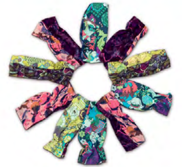
ASSORTED BEACH TURBANS* 1124MAX