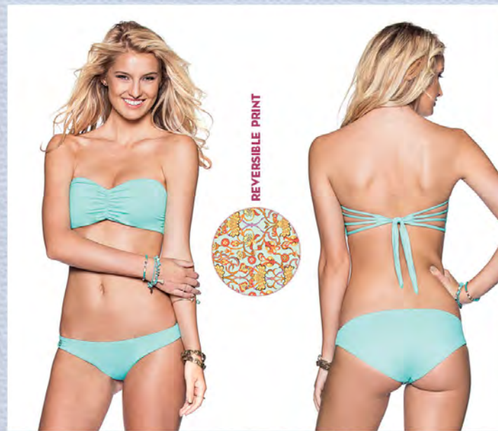
TOP Cyan Watercolors BOTTOM

1817MBB (Signature cut)* 1817MBC (Cheeky cut) S M L