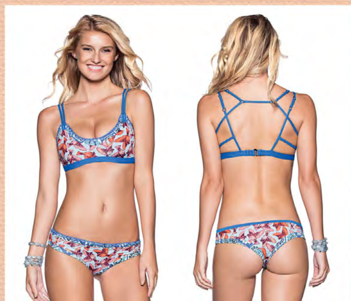
TOP Flying Matisse BOTTOM

1806MBB (Signature cut) 1806MBC (Cheeky cut)* S M L