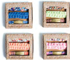
ASSORTED BRACELET KIT* 1119MAX