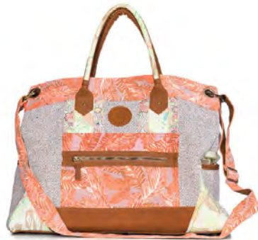
2. BEACH BAG 1131MAX