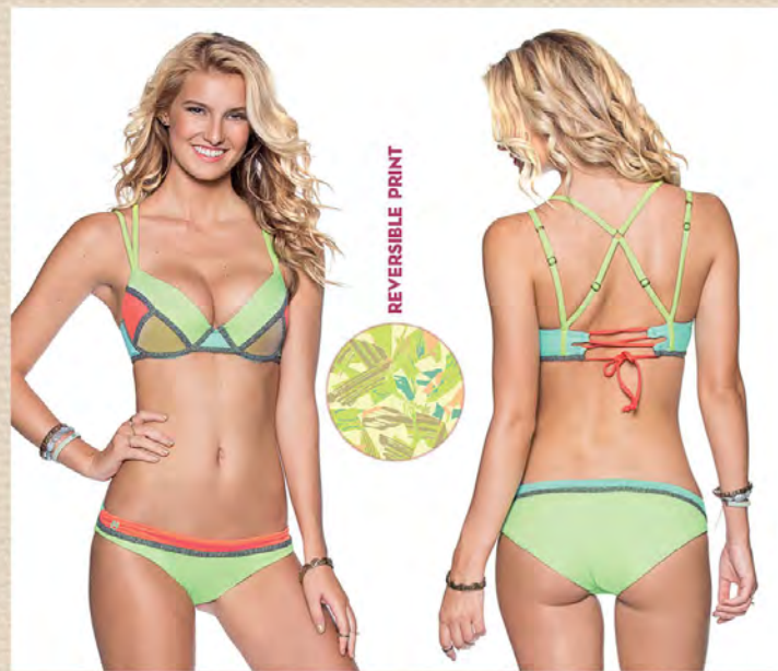
TOP Citrus Bauhaus BOTTOM

1506MTS (With graduated booster cup)* 1506MTN (Without graduated booster cups) 1506MBB (Signature cut)* 1506MBC (Cheeky cut) S M L S M L XL