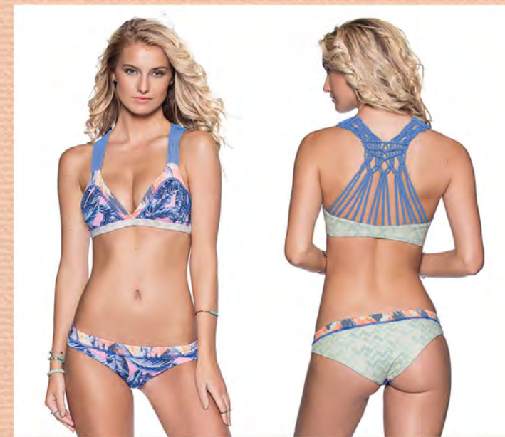
TOP Les Demoiselles BOTTOM

1503MTS (With soft cups)* 1503MTN (Without soft cups) S M L XL 1503MBB (Signature cut) 1503MBD (Chi chi cut)* S M L