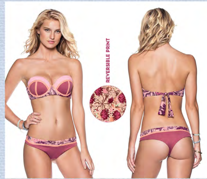
TOP Cinnabar Abstraction BOTTOM

1508MBA (Hipster cut) 1508MBB (Signature cut)* 1508MBC (Cheeky cut) 1508MBD (Chi chi cut) S M L