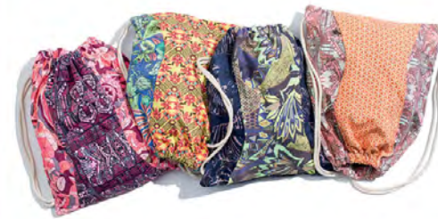
ASSORTED SPORTS BAG* 1108MAX