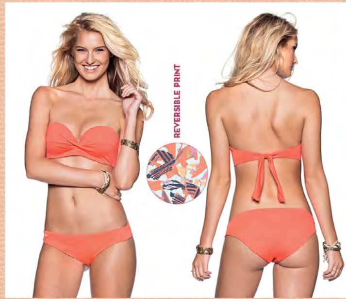
TOP Starfish Hue BOTTOM

1512MTS (With graduated booster cups)* S M L XL