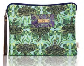
ELEPHANTS IPAD CASE 1117MAX