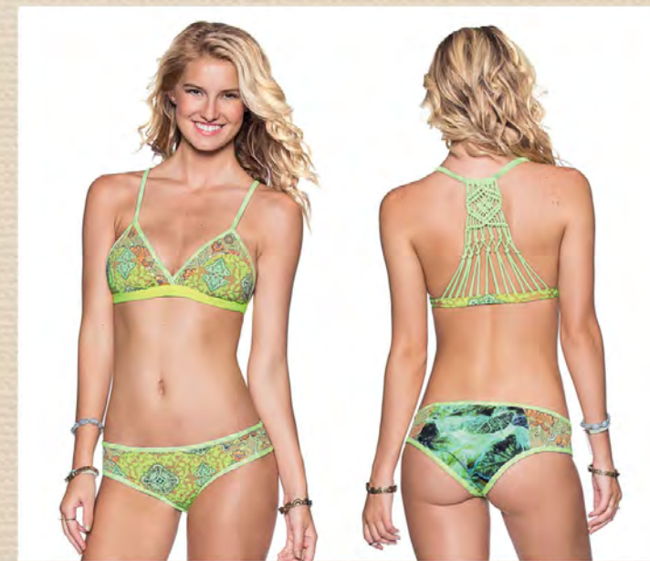
TOP Matisse Landscape BOTTOM

1507MTS (With molded cups)* 1507MBA (Hipster cut)* 1507MBB (Signature cut) S M L XL S M L