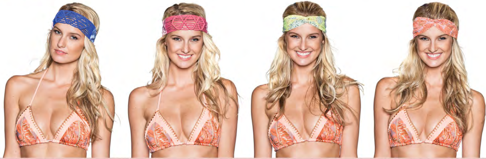
PALMS BEACH TURBAN 1135MAX