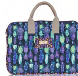
BUGS COMPUTER CASE 1115MAX