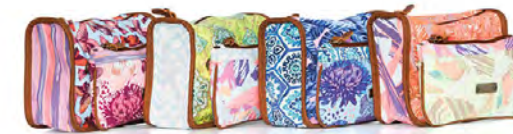
ASSORTED MAGIC POCKET* 1107MAX