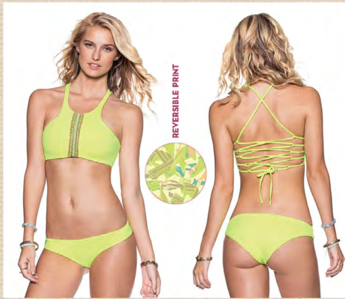
TOP Lime Surrealism BOTTOM

1504MTN (Without soft cups)* 1504MBA (Hipster cut) 1504MBB (Signature cut) 1504MBC (Cheeky cut)* 1504MBD (Chi chi cut) S M L XL S M L