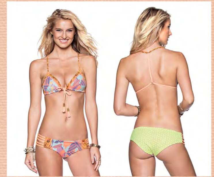
TOP Tassels Dalí BOTTOM

1823MBB (Signature cut) 1823MBC (Cheeky cut)* S M L