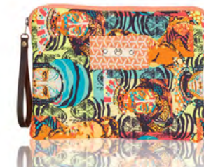
FACES IPAD CASE 1116MAX