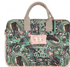
CERAMIC COMPUTER CASE 1114MAX