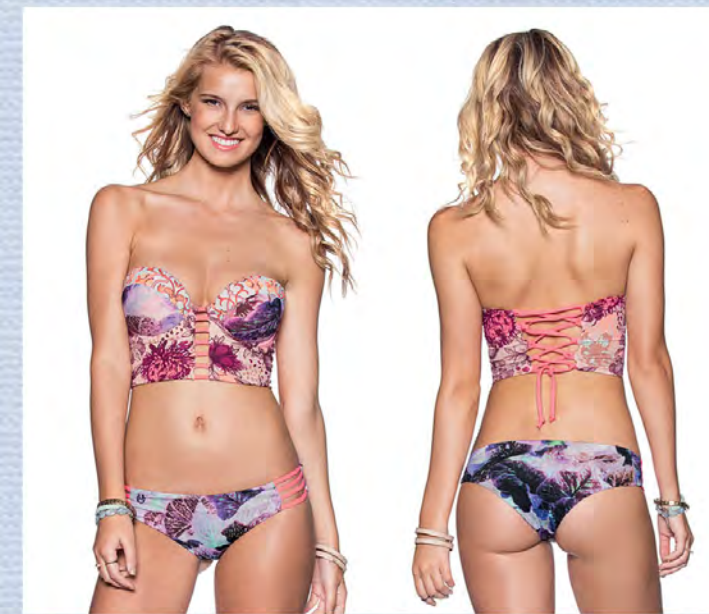
TOP Floral Expressionism BOTTOM

1511MBC (Cheeky cut)* 1511MBD (Chi chi cut) S M L