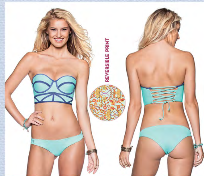
TOP Cyan Countour BOTTOM

1510MBA (Hipster cut)* 1510MBB (Signature cut) S M L