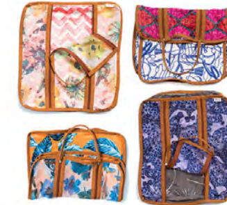
ASSORTED BIKINI BAG* 1109MAX