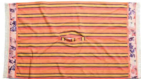
BEACH BLANKET 1133MAX