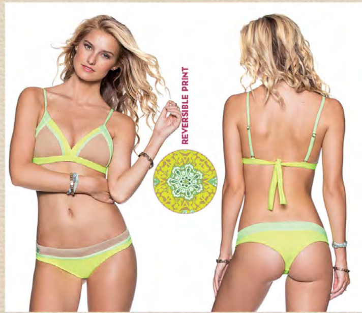
TOP Lime Collage BOTTOM

1504MTN (Without soft cups)* 1504MBA (Hipster cut) 1504MBB (Signature cut) 1504MBC (Cheeky cut)* 1504MBD (Chi chi cut) S M L XL S M L