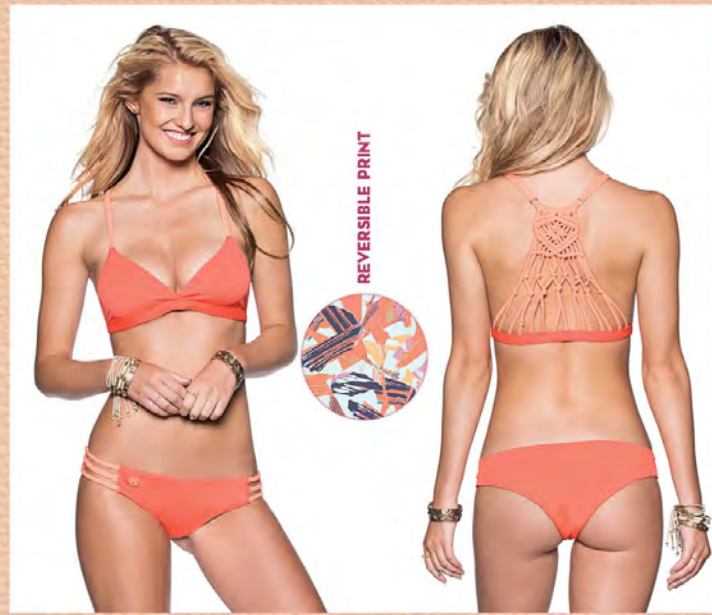
TOP Starfish Vibes BOTTOM

1512MBA (Hipster cut)* 1512MBB (Signature cut) 1512MBC (Cheeky cut) 1512MBD (Chi chi cut) S M L