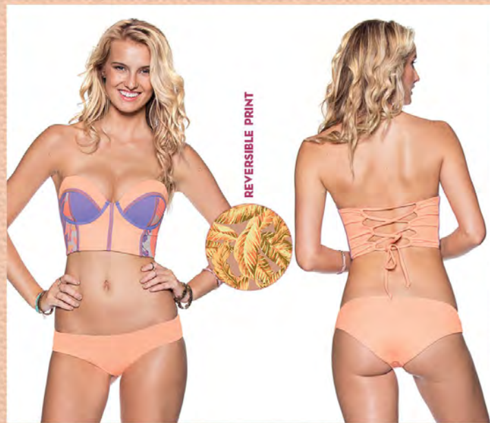
TOP Cantaloupe Cubism BOTTOM

1514MBB (Signature cut) 1514MBD (Chi chi cut)* S M L