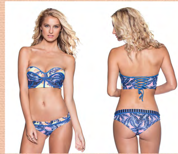
TOP Tropic Cubism BOTTOM

1501MTS (With soft cups)* 1501MTN (Without soft cups) S M L XL 1501MBB (Signature cut) 1501MBC (Cheeky cut)* S M L