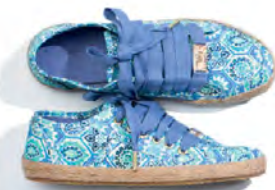
BLUE SNEAKERS 1120MAX 36 / 37 / 38 / 39 / 40