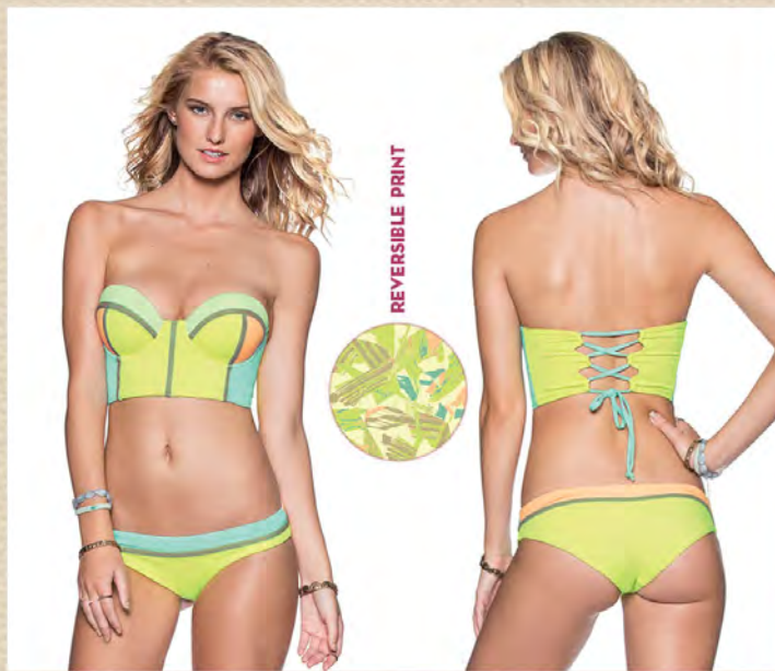
TOP Lime Cubism BOTTOM

1809MTS (With molded cups)* 1809MTN (Without molded cups) 1809MBB (Signature cut) 1809MBC (Cheeky cut)* S M L XL S M L