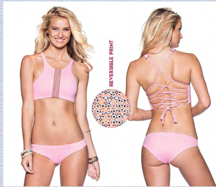
TOP Pale Rose Surrealism BOTTOM