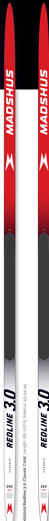
N20002 Redline 3.0. Classic Cold. Length: 182-207/5. Sidecut: 43-44-44